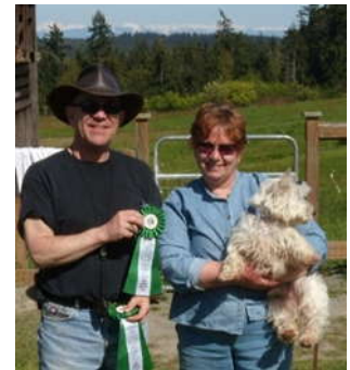
TED—two Qs in Senior