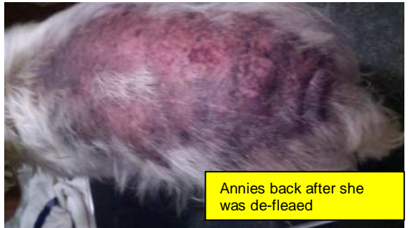
Annie's back after she was de-fleaed

Annie and Abbie – 10 yrs old Both girls were in horrendous shape. They had so many fleas having a party on their skin that it could have generated their own 'rave'. The fleas were so out of control that the fleas were jumping on the vet and the foster mom during examination. They were well mannered dogs, with an elderly owner who couldn't handle their skin problems. They came in with terrible skin